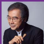
指揮 Conductor: 閻惠昌 Yan Huichang